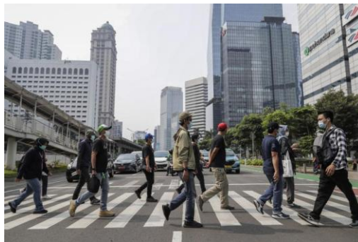
Figure 1. 1 Busy Urban Society, 2021

Every year technology is developing more rapidly. Many technologies have been created to help the sustainability of human life in various ways, such as the fields of communication and information, education, health, agriculture, economy and so on. The spread of the use of technology indicates that the relationship between humans and technology is increasingly inseparable. Indonesia is no exception which has a population of around 284,438,800 people (Badan Pusat Statistik, 2025). In 2024, 72.78% of Indonesia's population will access internet technology, and in 2023 as much as 69.21% (Badan Pusat Statistik, 2024). This indicates that Indonesia has entered the era of digital transformation that makes all activities feel easy, thus giving rise to fast-paced modern life habits. A fast-paced lifestyle is usually found in the life of urban people, which gives rise to a competitive spirit. Through the right perspective and execution, a fast-paced lifestyle can increase a person's productivity so that they are brave to try new things (Rendaniati, 2025).