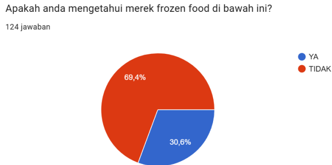
Figure 1. 4 Questionnaire Data Results, 2026

form of product imitation, so that the brand between Frozen Food and each other only has a thin differentiating boundary.