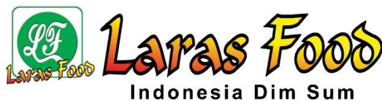
Figure 1. 2 Laras Food Logo, 2016

One example of ready to eat food that is widely known and consumed is Frozen Food, because it offers convenience in storing and preparing for consumers who are living a busy lifestyle (Anggraini et al., 2025). Frozen Food is food that has gone through a freezing process that aims to preserve so that it is easy and practical to consume (Suryani & Priatini, 2020). The state of frozen food can inhibit the performance of microbiology and enzymes so that food has shelf life for a certain period of time (Wulandari, 2023). Frozen Food can be made from a variety of raw materials, such as flour, fish, chicken, beef, fruits, vegetables and so on. There are also various types of processed Frozen Food, there are Frozen Food that has high nutritional value but there are also those that do not. Nutritious frozen food usually uses quality raw materials, has clear nutrition and uses the correct processing methods. Through freezing and cooling technology, it has been proven to be able to maintain the texture, taste, color of food, and the nutritional content in it such as proteins, vitamins and minerals (Sebayang et al., n.d.). One of the Frozen Food brands that uses nutritious and quality raw materials is Laras Food.