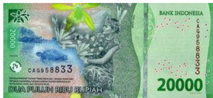
Figure 1.1. Banknote: 20,000 Indonesian Rupiah, 2022 Issue (Source: Bank Indonesia, 2022)

The Derawan Islands, designated under Government Regulation No. 50 of 2011 as a National Strategic Tourism Area (KSPN) among 88 other listed areas, position these four islands as a potential marine tourism destination to be developed as a national and international tourism icon. As shown in Figure 1.1, Derawan Island is featured on the 2022 edition of the Rp20,000 banknote, making it one of the symbols of Indonesia's marine wealth