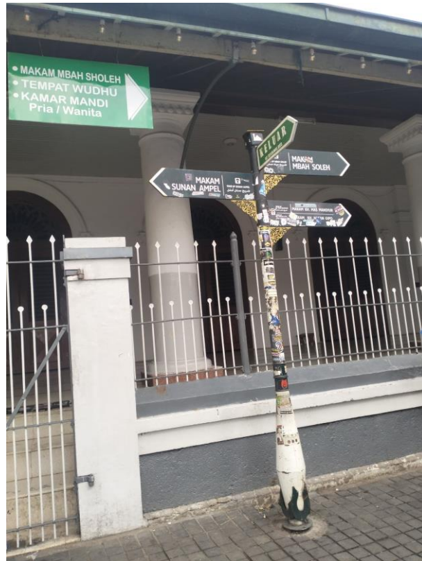
Figure 1. 1 Ampel Mosque Area Surabaya, 2025

Ampel Mosque is a legacy from Sunan Ampel. Ampel Mosque has now been made into the oldest Islamic cultural heritage center in Surabaya (Putra & Tucunan, 2021:71). Ampel Mosque is located in Ampel Denta (Holy Ampel) which is now in the North Surabaya area. Ampel Mosque was built by Sunan Ampel in the year 1421 (Husain, 2010:127).