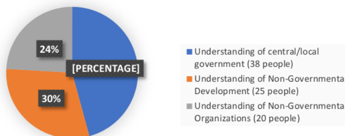
Figure 1. Respondens Knowledge of Program Resources Urban Farming

Public knowledge of the types of Urban Farming programs can be seen from the results of interviews. There are two types of Urban Farming programs, namely the use of vacant land and production and processes. The knowledge that the people of Taman and Sogaten Villages know about Urban Farming refers to their understanding of the program. Knowledge is needed before doing an act or activity consciously, this is as visualized in the following graph: