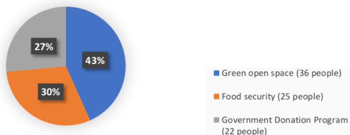
Figure 2. Respondents Knowledge of Types of Urban Farming Programs

"That the results of Urban Farming are not only for self-interest but also for sale through groups. Urban Farming has been around for about 3 years. This is a City government program from the Department of Agriculture. This program is mandatory for all kelurahan, meaning that all kelurahan must exist" (Interview results dated 28 June 2022).