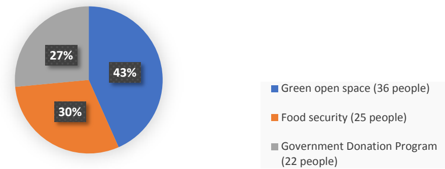
Figure 2. Respondents Knowledge of Types of Urban Farming Programs

"That the results of Urban Farming are not only for self-interest but also for sale through groups. Urban Farming has been around for about 3 years. This is a City government program from the Department of Agriculture. This program is mandatory for all kelurahan, meaning that all kelurahan must exist" (Interview results dated 28 June 2022).