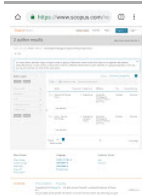
Bukti Nama di Scopus_2019.jpg 302K

--- sent from DELL Inspiron 7472 (Core i7 - 8550U)