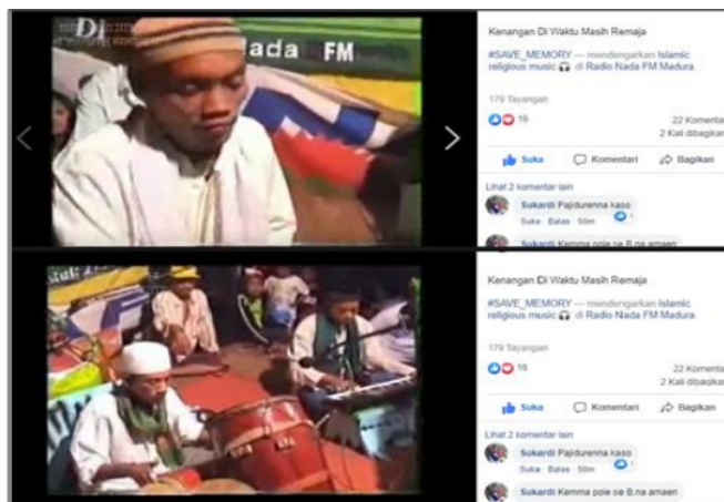
Figure 1: Facebook live streaming: The performance of Madurese traditional instrument music in Islamic religious music of Sumenep Ramadhan Festival

Nada FM made improvements in the news section by adding personnel to the reporter's position for the news coverage programme because, at that time, no radio broadcasted news and local issues about Sumenep and the surrounding area. It also updates the supporting broadcast technology, such as recording studios, editing computers, mixers, on-air computers, and others. The new management was committed to promoting education for the Sumenep residents despite the status of commercial radio. For this reason, all its programmes emphasise the identity of Islamic da'wah and Madurese culture.