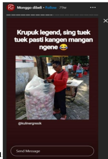
Figure 1 Instagram story highlight menu. https://www.instagram.com/stories/highlights/18027051532023501

It also can be seen from the number of followers who see the broadcast and like the post. As an example of figure 2, in the highlight upload at least 6 minutes after posting, this account has received 108 likes, in 3 hours the video has been played 12,736 views.