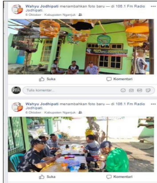
Figure 3: Discussion in "hanging out together," as an informal meeting room for the listeners' community

Virtual social communities such as the WhatsApp group can be reviewed based on the perspective of modern-mass society theory from Georg Simmel (1858-1918). A sociologist with original, intelligent thinking with simple language that is easy to understand. Two textbooks become required reading for those who want to think about the relationship between identity and the city. The two books are Die Großtadt und das Geistesleben (The Metropolis and Mental Life) published in 1903, and Exkurs Tiber den Fremden (The Strangers) published in 1908 (Bouchet, 1998). One hundred years after Simmel, we are still relevant to renewing the understanding of the relationship between identity and city life in the information technology era (Chayko, 2015). The concept of 'the strangers' in the metropolis has found a new form of sociology. Metropolis used to be meaningful as a form of social structure where people gathered openly, but now the metropolis is virtual communities that live in networks or a network society (Fearon, 2004).