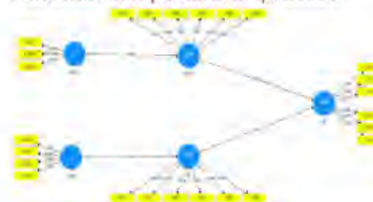
Figure 1. Measurement Model

In the current study, 500 individual researchers were targeted for data collection and these individual researchers are the respondents for the questionnaire.