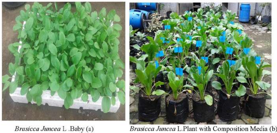
Fig.2. Green mustard plant before (a) and after transplanted (b)