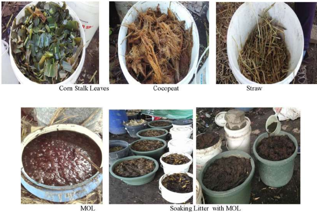
Fig.1. The Ingredients of Planting Media

Planting of mustard seed sowing in tray for 3 weeks, then transplanted to polybags that have been provided, one seed / polybag (Fig.2). Plant maintenance were watering and 9eeding. Variable observation of the length of the plant, the number of leaves, leaf area, wet weight of the plant, root length and the number of roots.