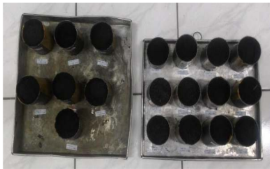
Figure 1. Briquettes Sample

Briquettes have a high hygroscopic characteristic which is quickly absorbing water from the surroundings, so the calculation of water content aims to determine the hygroscopic properties of charcoal briquettes as a result of research (Putri & Andasuryani, 2017). The lost water content (%) is determined using equation 1 (Ikelle et al., 2014).