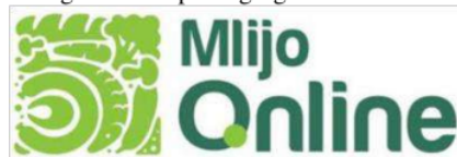
Figure. 1 Instagram Account Logo @mlijo.online.mjk

Based on the observations of the researchers, the researchers found that in addition to providing various basic ingredients with grade B product quality and packaging, such as in supermarkets, they also offer a deposit service for various products on the market in the form of needs desired by consumers. So, consumers don't need to go to the market and visit different stores to fulfill their desired needs so that consumers become more practical and don't have to bother going out of the house, especially during the COVID-19 Pandemic. The Instagram account @mlijo.online.mjk also uses a logo on their packaging and is the hallmark of @mlijo.online.mjk..