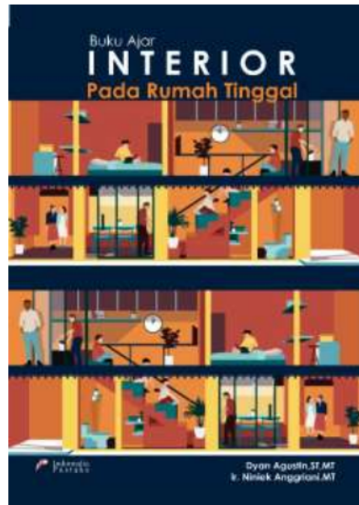
Figure 2. Book cover

The selection of images on the cover is based on images that can imply a description of the content in the textbook. In this case, a cutout image of the interior space is selected which shows the furniture and human activities in it. Images are packaged in graphic format to make them look more attractive and following student characters. Book cover using A4 size Soft Cover which contains the book title, snippets of images in the book, author's name, and publisher logo. The color used is a dark blue, orange, yellow, and white background.