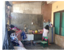
Fig. 3. Sewing business by using the front yard of the house

The changes and slight increase above are caused by several factors. On the internal factors of the occupants, the average kitchen is added to the backyard because the developer does not provide a kitchen at the core of the house. The first additional space that is almost done by residents of the 21m2 type of house is the kitchen and without waiting for the availability of more funds. This is because the kitchen is included in the category of service space where its presence is needed by residents. So even though funds are not yet widely available, residents still try to have a kitchen even though they only use roofing material from asbestos waves and are not partitioned. The kitchen here also functions as a warehouse and washing place due to limited space.