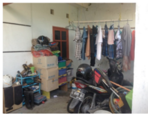
Fig. 4. Front yard area for drying clothes and motorcycle garage

In the midst of changes the occupants only add to the room at the back of the house which is to add a bedroom and kitchen. The addition of sleeping space in the backyard area is due to the increasing age of the child. In the beginning, they inhabit using a room that has been provided by the developer. As time goes on the age of the child increases, it requires more privacy so that it requires another room. The