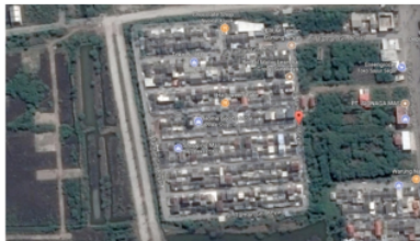
Fig. 1. Photo of the research area in the Taman Gunung Anyar housing estate in Surabaya

Housing Gunung Anyar Park Surabaya was used as the location of the study because the development of simple housing development in the area was quite rapid. The object of research is a simple house with an area of 21m 2 which experiences changes and increases in space. Case taking method is done by purposive sampling, namely sampling with a specific purpose. This is so that more varied data can be obtained and can produce more complete data.